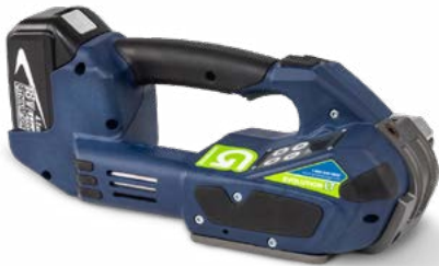
NEW! EVOLUTION LT SMART STRAPPING TOOL

This lever-free, fully automatic, battery-operated strapping tool with Bluetooth technology for smart device setup. It's lighter, faster, safer, and gets to the desired tension faster than other tools!