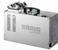
SX600 NEW! LIGHTWEIGHT, 1-PERSON HANDLING