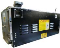
TR1400 FOR METAL CANS + PLASTIC BOTTLES