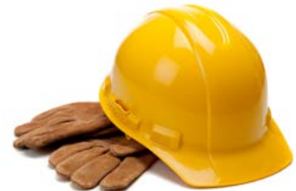
SAFETY IS OUR PRIORITY PROTECTING YOUR PEOPLE

These rugged dispensers are easy to load. The all-mechanical design simplifies the mechanism, which makes loading new rolls of strap quick and reduces pauses for changeovers.