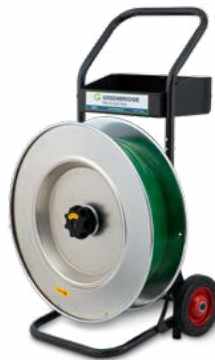
HEAVY-DUTY STRAP DISPENSER EFFICIENCY BOOSTING

This lever-free, fully automatic, battery-operated strapping tool with Bluetooth technology for smart device setup. It's lighter, faster, safer, and gets to the desired tension faster than other tools!