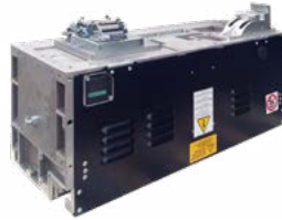
TR1800 FOR GLASS BOTTLES + JARS